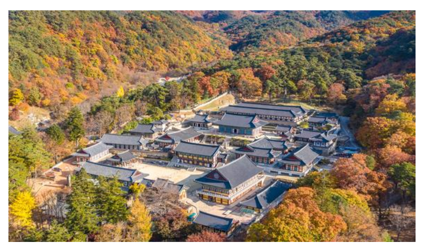
Day 11 Gangneung - Mt. Sorak - Seoul

After breakfast, drive to Haeinsa Temple located in Gayasan National Park. Haeinsa Temple was founded by King Ae-Jang of Shilla Dynasty (802), well known for its famous treasure "TripitakaKoreana" (UNESCO world heritage) composed of 81,341 printing woodblocks made to repulse the Mongolian Army Invasion with support of Buddha. And then transfer to AndongHahoe Village which has preserved the housing architecture and the village structure of the Joseon Dynasty. Moreover, the Village was not artificially created; there are people who actually live there. The Hahoe Village has become world-famous for the visit of The Queen Elizabeth II of Britain several years ago. And then transfer to Pyeongchange, one of 2018 Pyeongchang Olympic Cities.