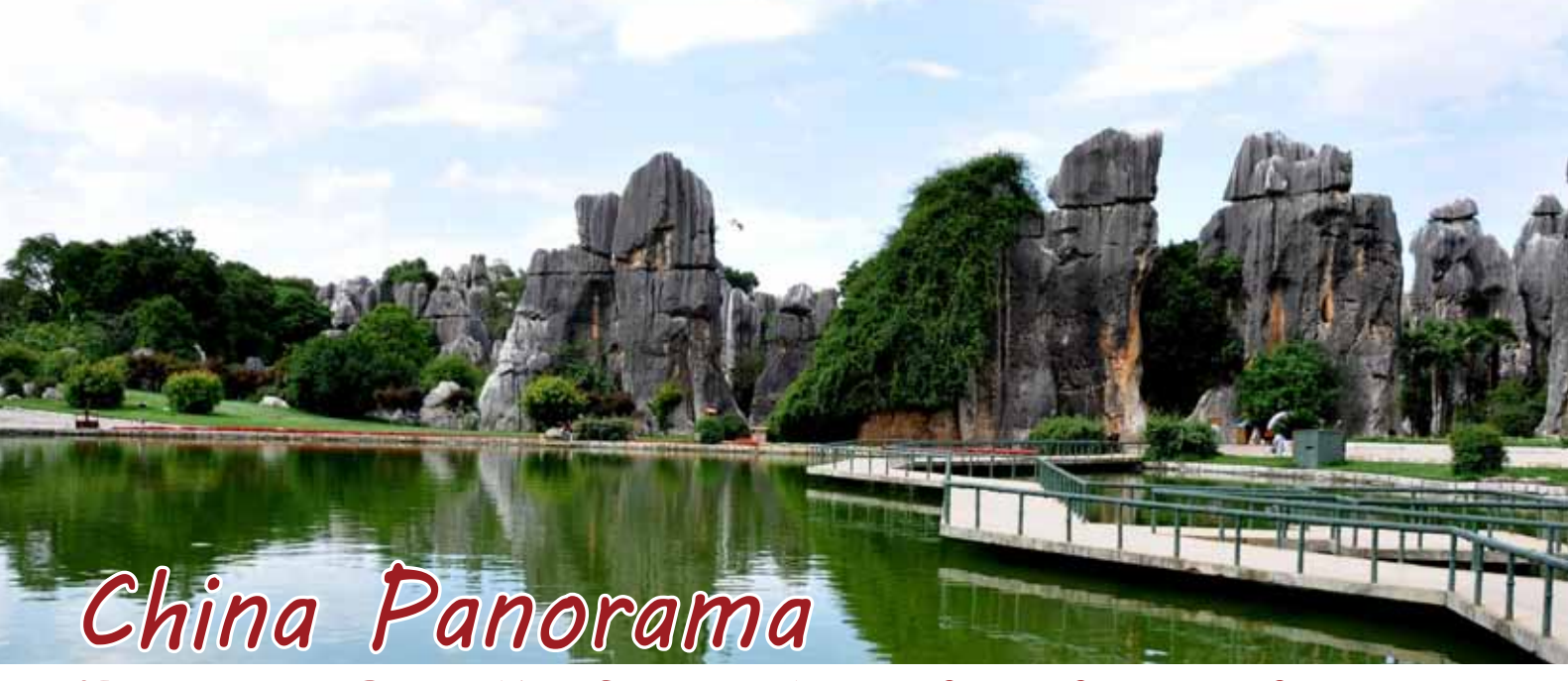
25 day tour to Beijing, Xian, Shanghai, Yangtze Cruise, Chongqing, Chengdu, Shangri-La, Lijiang, Kunming, Longsheng Rice Terrace, Li River & Guilin

This tour starts in the bustling city of Beijing where we'll visit the Forbidden City and the Great Wall. Another fantastic highlight of this tour is to visit the magnificent Terracotta Warriors and Horses, which are considered to be one of the greatest archaeological finds of the last century. After visiting the modern city of Shanghai, we then board our cruise ship to experience one of the world's greatest waterways the Yangtze River. Then you will visit southwest part of China where are with unique sceneries and minorities' cultures. From Ancient Town of Lijiang to Shangri-La and you will visit the spectacular Stone Forest in Kunming, and finish at the beautiful landscape of Guilin.