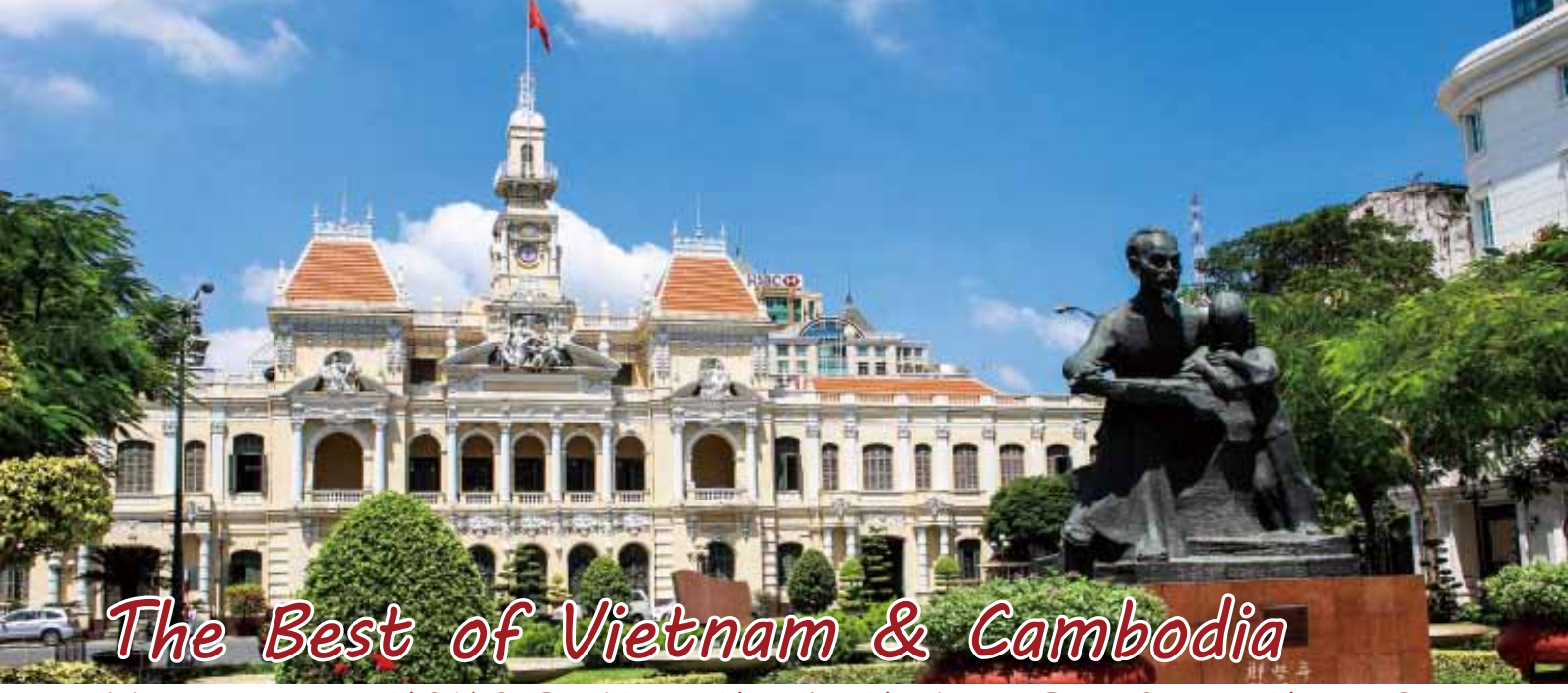
16 day tour to HCMC, Da Nang, Hoi An, Ha Long Bay Cruise, Hanoi, Siem Reap & Phnom Penh

Discover the historic cities, verdant agriculture, and glittering bays of Vietnam and be captivated by the warmth of the people you meet. Uncover the youthful excitement of Saigon, learn about the Cu Chi tunnels, shop at the living museum city of Hoi An; float across Ha Long Bay on boat and enjoy the unique water puppet show in Hanoi. Then explore the UNESCO heritage of Angkor Wat and the unique floating village on the Tonle Sap Lake, etc. in Siem Reap, followed by visit to Phnom Penh, the largest city in Cambodia.