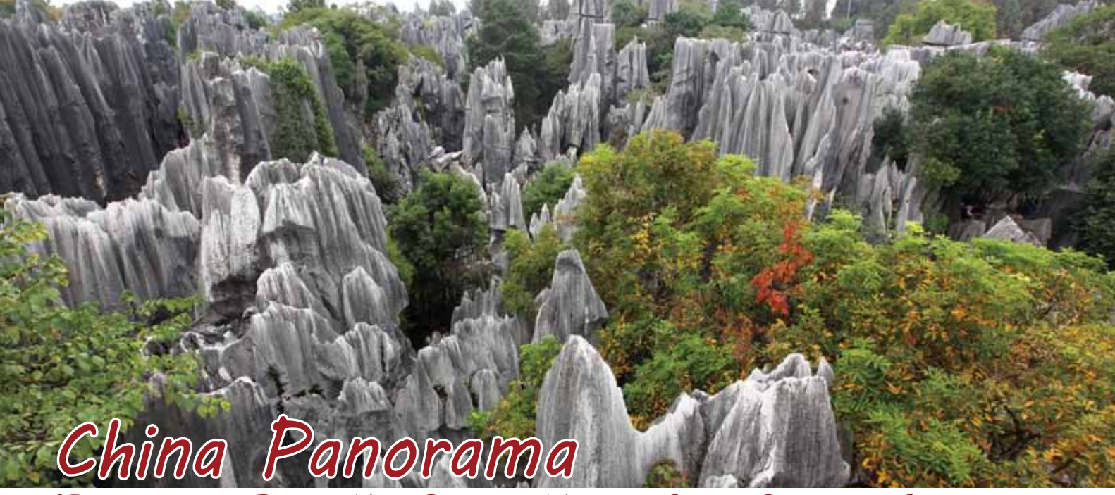
25 day tour to Beijing, Xian, Shanghai, Yangtze Cruise, Chongqing, Chengdu, Shangri-La, Lijiang, Kunming, Longsheng Rice Terrace, Li River & Guilin

This tour starts in the bustling city of Beijing where we'll visit the Forbidden City and the Great Wall. Another fantastic highlight of this tour is to visit the magnificent Terracotta Warriors and Horses, which are considered to be one of the greatest archaeological finds of the last century. After visit the modern city of Shanghai, we then board our cruise ship to experience one of the world's greatest waterways the Yangtze River. Then you will visit southwest part of China where are with unique sceneries and minorities' cultures. From Ancient Town of Lijiang to Shangri-La and you will visit the spectacular Stone Forest in Kunming, and finish at the beautiful landscape of Guilin.